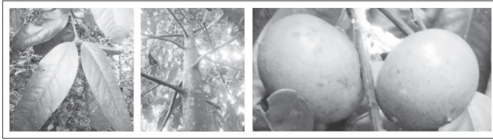
Fig. 1. Leaves, branches and fruit of Garcinia dulcis grow in Desa Klahang.